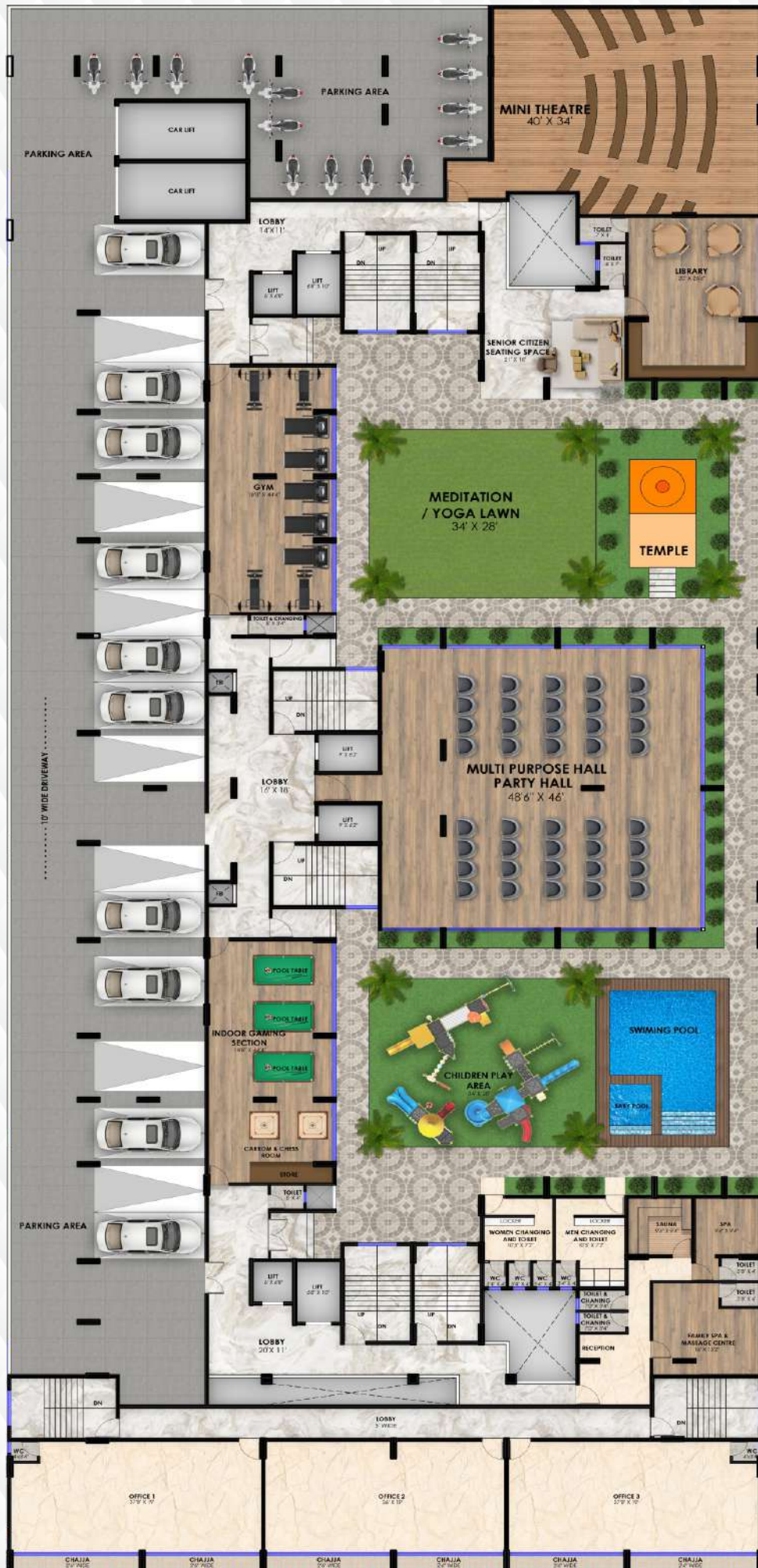
PODIUM FLOOR PLAN