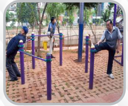
PLACE FOR SENIOR CITIZEN