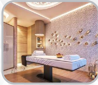
MASSAGE ROOM 2